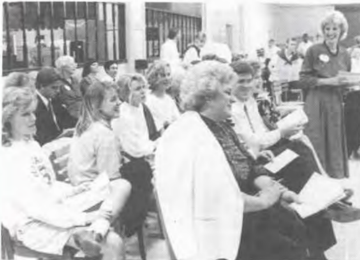
Friday night's Benefit Dinner/Auction got the Weekend off with a bang. Students and alums raised about $9,500 for the Lindenwood/Soviet Exchange Program. The evening's menu consisted of borscht, caviar, red cabbage and beef tenderloin. (It was actually good.)

Since pictures tell more than words, we have assembled this scrapbook for you to enjoy. . .