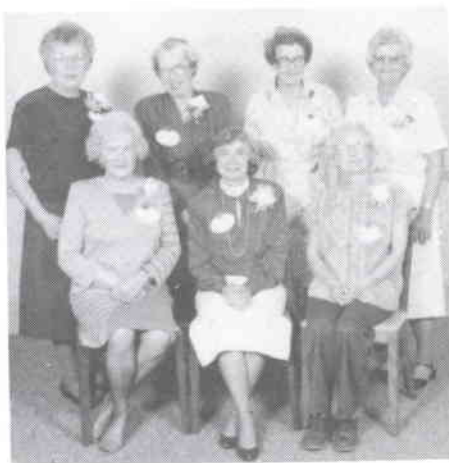
Our "golden girls" from the Class of 1939 celebrated their 50th anniversary!