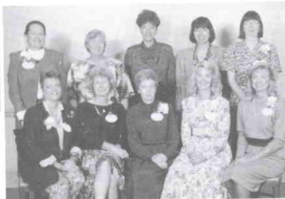
Congratulations Class of 1964 on your silver anniversary!