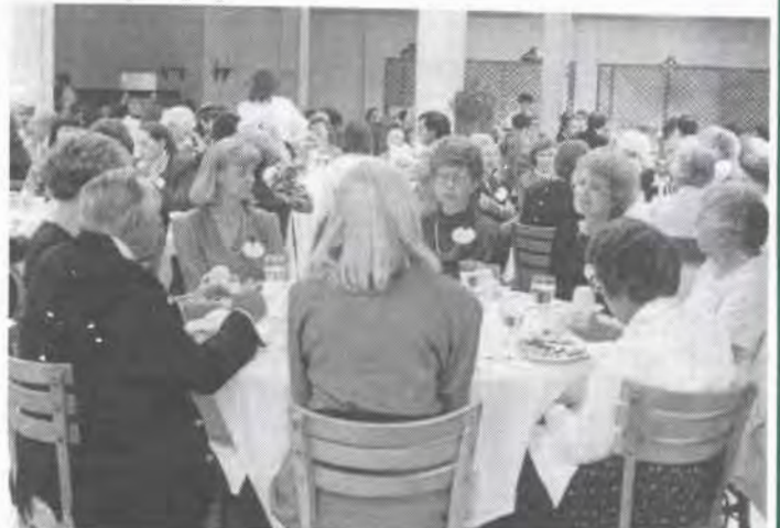
About 125 alumni, faculty and staff attended the Alumni Association's Annual Meeting and Luncheon.