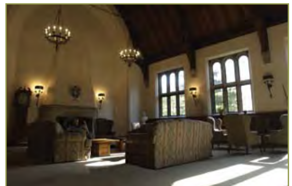
Butler Library interior.