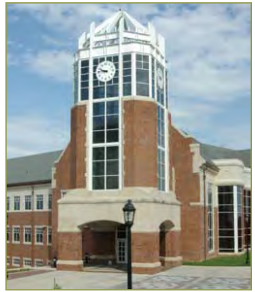
The Spellmann Campus Center clocktower, above.