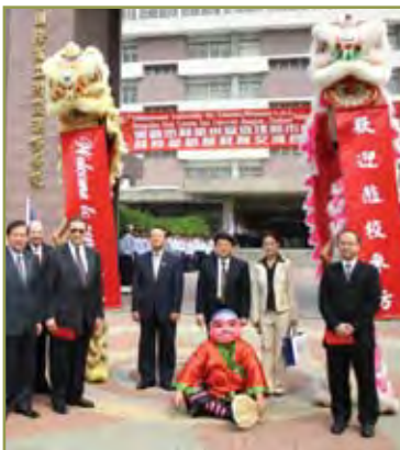
The Lindenwood delegation is welcomed to Taipei.