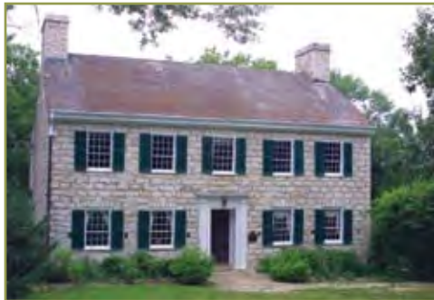
The historic Daniel Boone Home, Defiance, MO.

In 1998, Lindenwood acquired the Daniel Boone Home property in Defiance, MO, with a pledge to restore and enhance the popular tourist attraction. The University began acquiring adjacent property and purchasing forgotten historic buildings with the idea of restoring them at Boonesfield Village, which is a part of the 261-acre Boone property.