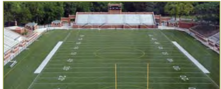
A panoramic view of the football stadium from the 4th floor of the Spellmann Campus Center.