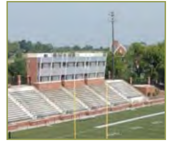
The new two-story press box towers over the athletic stadium.

Several hundred luxury seats were added in the east end zone beneath the Spellmann Campus Center, and a 1,000 seat student section was constructed in the opposite end zone. A concession stand and restrooms are located beneath the student section. The west end zone brick façade features the LU brand, and a brick greeting area named Kirchner Plaza invites game attendees to gather before and after sporting events.