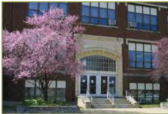
The front door to Lindenwood's new campus in Belleville, IL.

The largest program at Lindenwood's Belleville campus is teacher education, which is fueled by professional development efforts for local teachers and school districts. More than 250 teachers are already enrolled in the Master of Arts in Education program in Belleville.