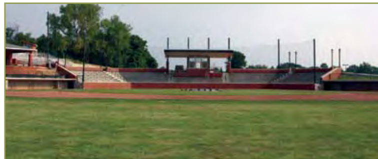
A view from centerfield of Lindenwood's new baseball stadium, part of the new Lou Brock Baseball/Softball Complex.