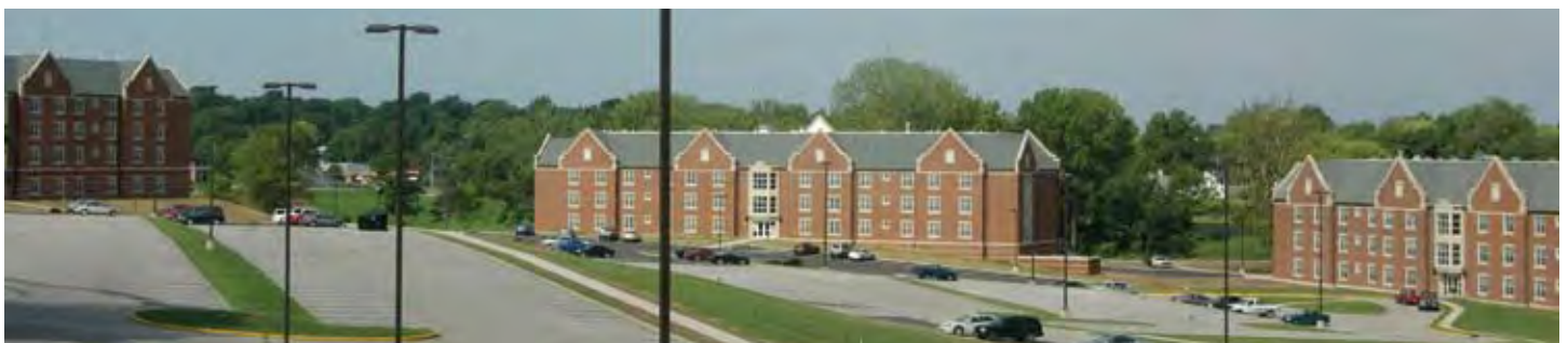
Rauch Memorial Hall, Calvert Rogers Hall and Guffey Hall as viewed from the Spellmann Campus Center.