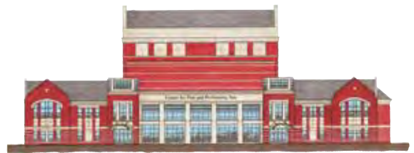
An artist's rendering of the new Fine & Performing Arts Center.

Built on the western edge of the campus where a drive-in theater once stood, the centerpiece of the 132,000 square foot facility will be a 1,200 seat main auditorium for theater, music, dance, lectures and other events. The structure will feature a main gallery to showcase student art and professional exhibits, and double as a reception area for events scheduled in the main auditorium.