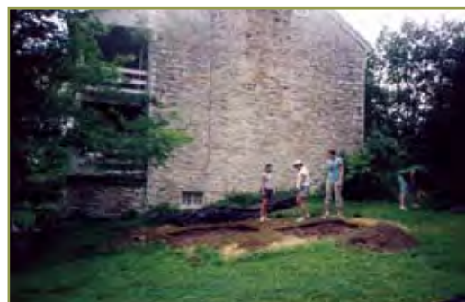
Archeology class at the Boone Home.

If you are interested in establishing an endowed fund in perpetuity to secure the future of Lindenwood University, please call 636-949-4903 or email development@lindenwood.edu .