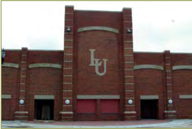
The front entrance to the stadium has been named Kirchner Plaza, in honor of Kirchner Block and Brick.

All seats in the stadium were replaced and a two-story press box with a VIP suite was constructed. Kiosks were built for ticket and merchandise sales, and the entire stadium was given a face-lift, which was enhanced with wrought iron and brick fencing.