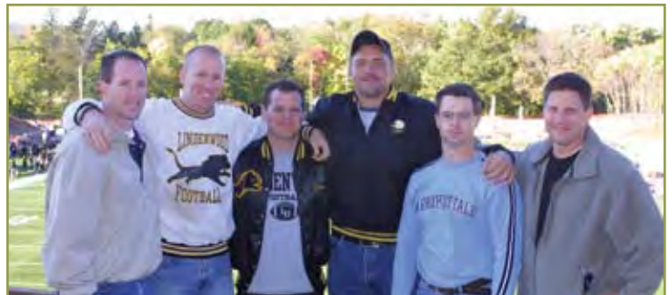
Members of Lindenwood's first football team (1989) enjoyed Homecoming in Fall 2004.

Please consider participating in our "Class Reunion Campaign" by donating a class gift to support student scholarships. Countless alumni are making a difference for students attending today by providing scholarship assistance.