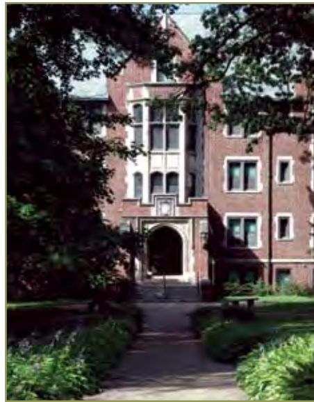
Irwin Hall in all its splendor.

The newly renovated athletic stadium, at left, will be home to Lindenwood's football, soccer, Lacrosse and field hockey teams.