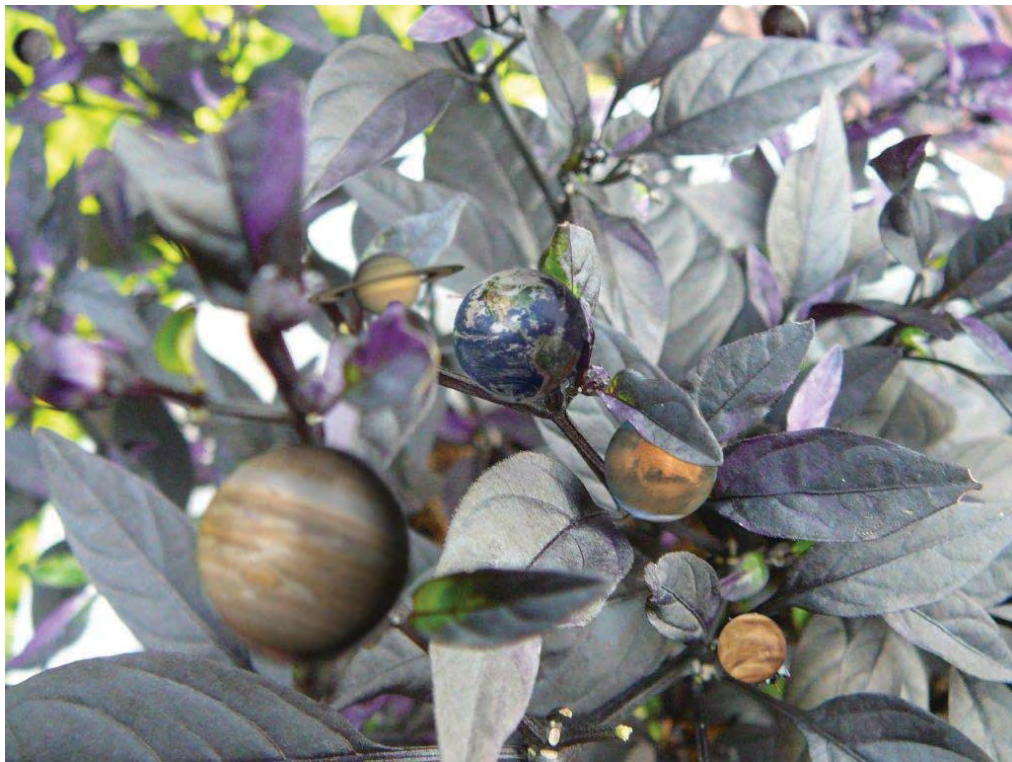
Gary Burkhead, Yggdrasil