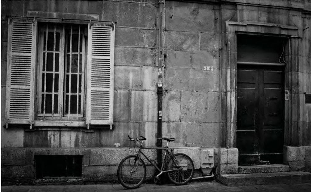
Olivia Saldaña, Bike