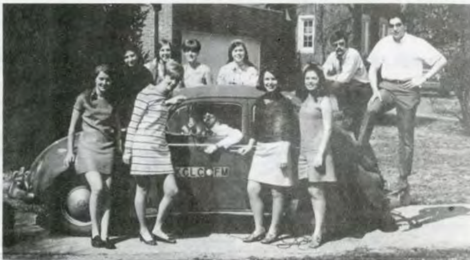
KCLC Staff of 1968

Reunion '93 & Alumni Career Symposium October 22-24