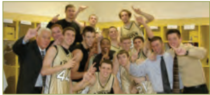
The LU men's basketball team celebrates its conference championship.