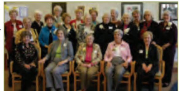
The Class of '55 gathers for a group picture at Reunion 2005