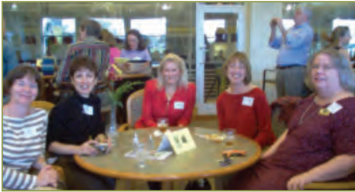
Class of 1975 members enjoy the reception sponsored by the St. Charles Alumni Club on the first night of reunion 2005.