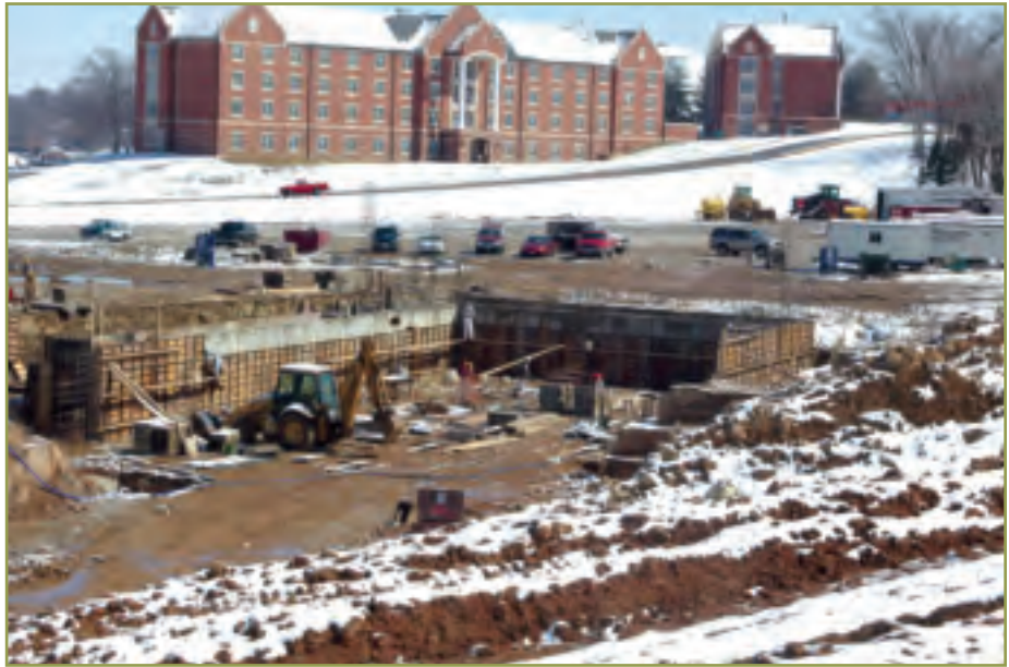
Workmen are busy with foundations and footings at the site of Lindenwood University's $32 million Fine and Performing Arts Center.

A 1,200-seat main auditorium will be the signature element of the new center, and it will be host to theater, music, dance and other productions. The structure will boast a main gallery to showcase student art and professional exhibits, and double as a reception area for events scheduled in the main auditorium.