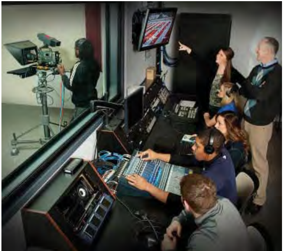
Lindenwood University-Belleville's new communications center includes a television studio with the latest high-definition equipment.