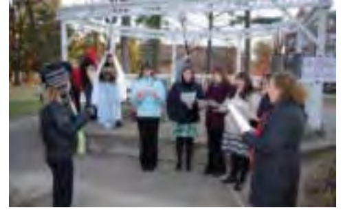
The old gazebo was used for events like Christmas walk (above). The structure's design follows the original 1980s concept. A dedication is scheduled for noon on June 1 during the Alumni Picnic.

In the mid-1980s, students and alumni from the classes of that era raised funds to construct a gazebo on the Heritage Campus of Lindenwood College. An architect was commissioned, blueprints were drawn up, and some money was raised. The project was started, but not fully completed, resulting in a white wooden structure in front of Irwin Hall—until recently.